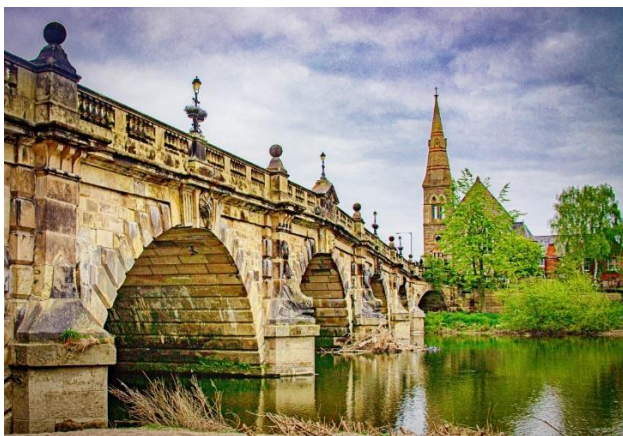
The River Severn at Shrewsbury

Not 'Another picture of Powick Bridge' but 'I've never seen Powick Bridge like that!'